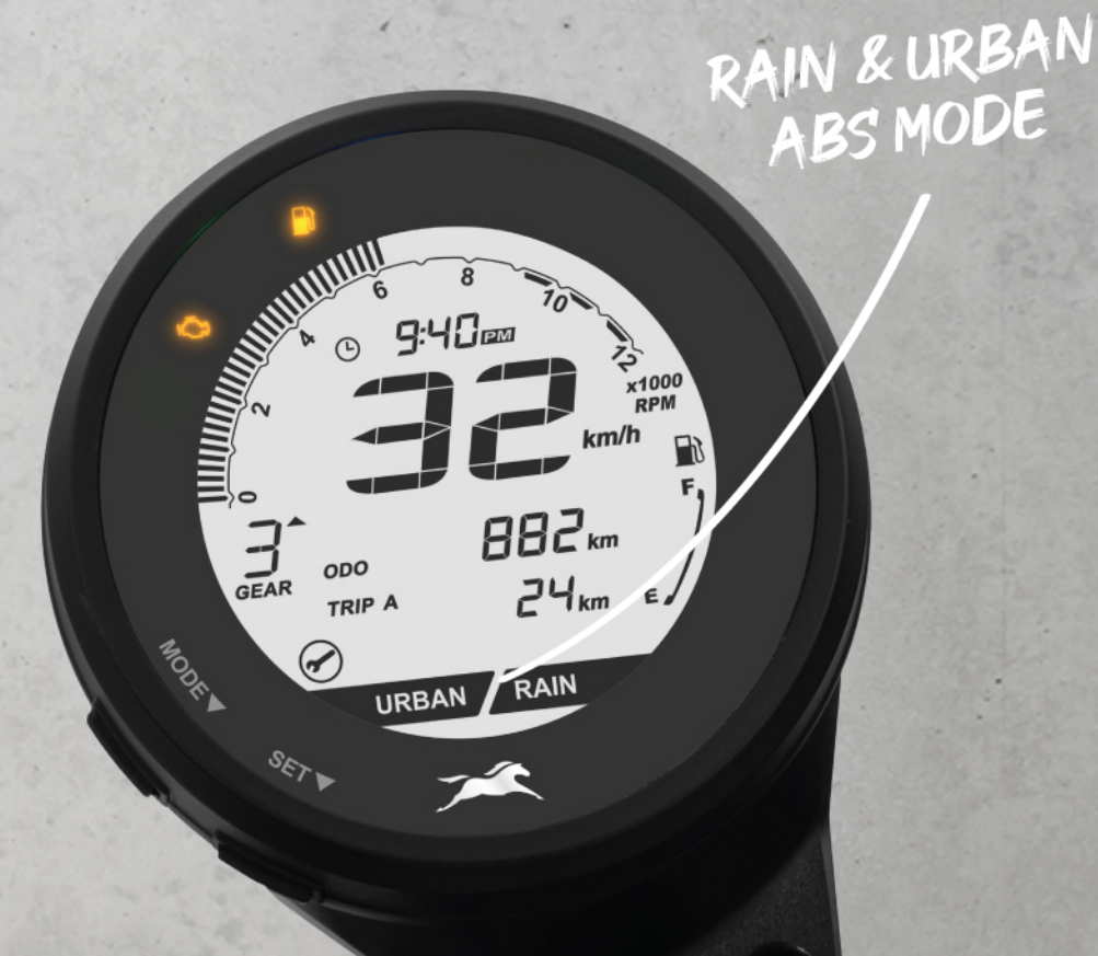
RAIN & URBAN ABS MODE