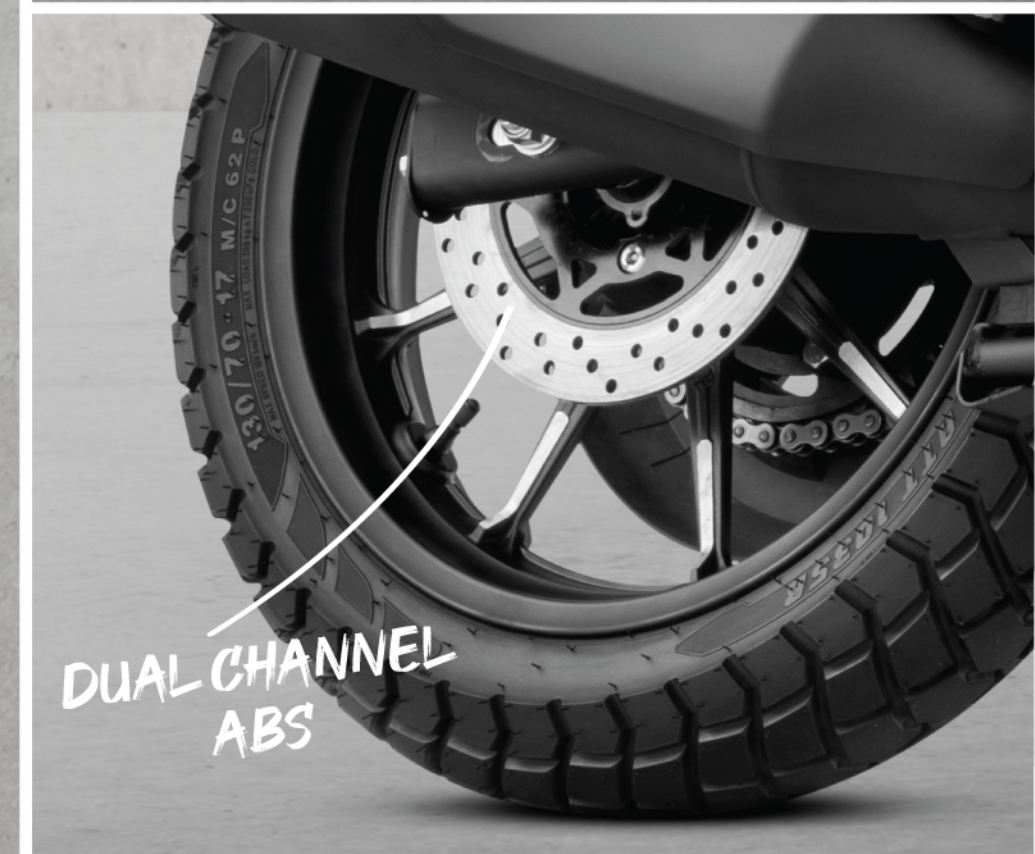
DUAL CHANNEL ABS