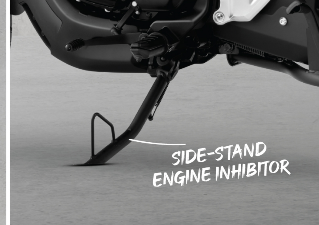
SIDE-STAND ENGINE INHIBITOR

Engineered to keep you safe, the TVS RONIN's switchable rain & urban ABS modes allow you to ride and brake confidently in the rain, and in the unpredictable urban jungle! Safety also comes in the form of a side-stand engine inhibitor which makes sure you ride, only once the side-stand is safely tucked away. While the large front & rear disc brakes with dual channel ABS make sure you come to a safe and stable stop, every time.