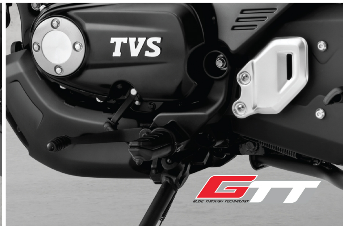
GTT GLIDE THROUGH TECHNOLOGY